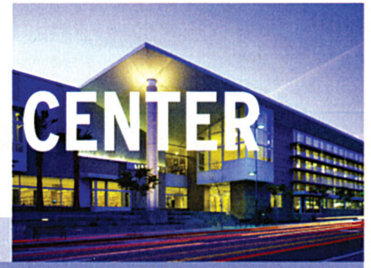
Santa Monica Main Public Library, Santa Monica, California