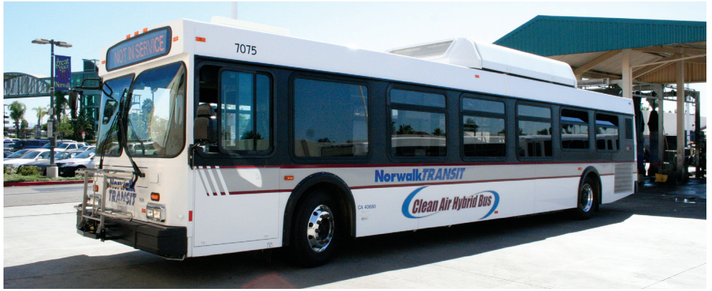
The City of Norwalk will purchase nine gasoline hybrid buses for the Norwalk Transit System.

The City of Norwalk purchased 3 New Flyer brand, Hybrid Gasoline-Electric buses within the past eighteen months and is committed to the clean air technology. These buses are able to provide the same level of mass transit service to the ridership while significantly reducing up to 90% of the harmful particulate matter, CO2 and