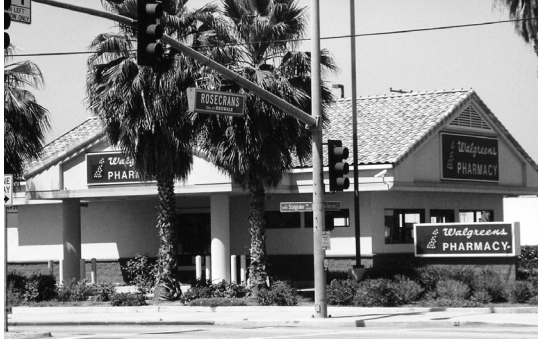
Last year's first place winner, Walgreens Pharmacy

The City of Norwalk Community Promotion Commission is inviting all businesses to participate in the 2006 Business Beautification Contest. Businesses will be judged based on their general appearance, maintenance, use of landscaping, neighborhood impact, and creativity. Winners will receive Business Beautification certificates and gift certificates from Lowes Home