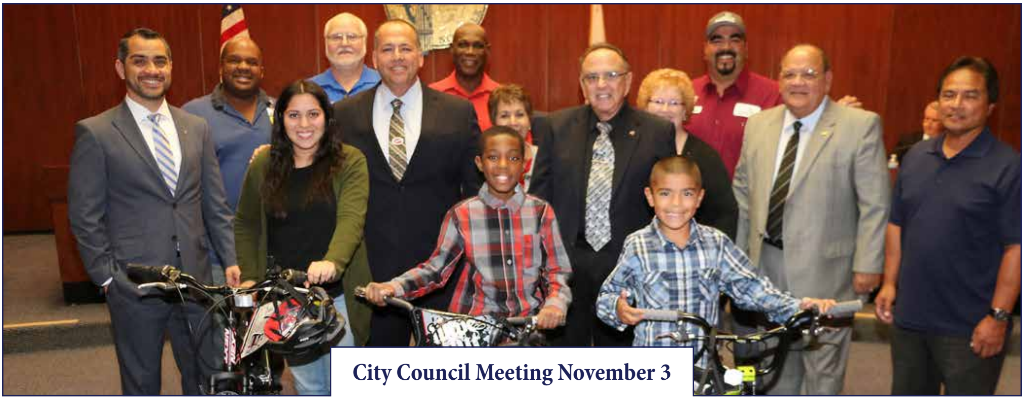
City Council Meeting November 3