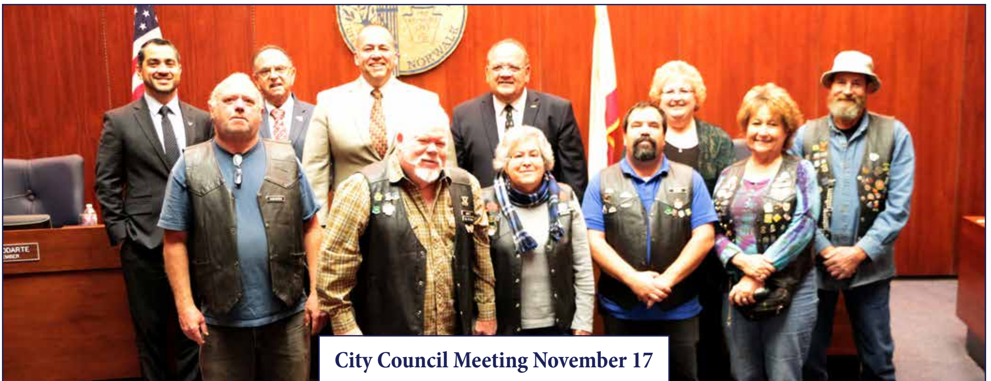
City Council Meeting November 17