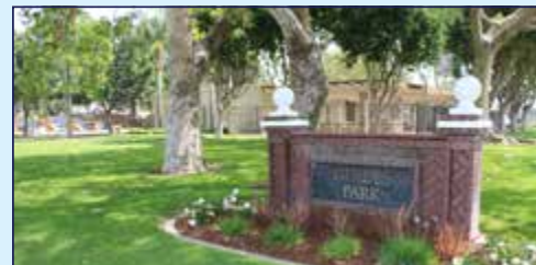
Gerdes Park Recreation Center 14700 Gridley Rd. (Capacity: 70 Banquet Style)