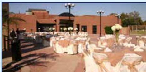
Hospitality Courtyard (Capacity: 200 Maximum with outdoor setting)