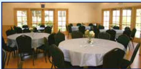
Sproul Reception Center (Barn) (Capacity: 72 Indoor, 100 Indoor/Outdoor)