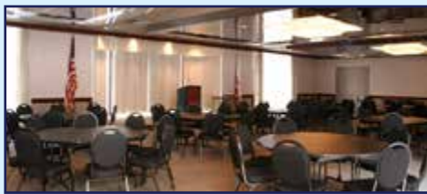
Sproul Room (Capacity: 150 Maximum)

With weddings, graduations, quinceañeras and reunions on the horizon, look to the City of Norwalk to rent the perfect space for your perfect event. The City offers facilities to meet just about any need and any budget. For complete listing of rental rates and detailed specifications, call (562) 929-5566 or click to www.norwalkca.gov .