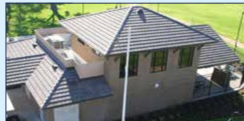
Sara Mendez Park Recreation Center 11660 Dune St. (Capacity: 44 Banquet Style)