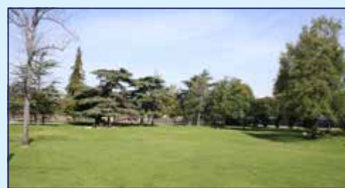
Shoshonean Campsite (Robert White Park) 12120 Hoxie Ave. (Capacity: 250)