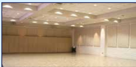
Rich Rehearsal Hall (Multi-Purpose Room) (Capacity: 150 Maximum)