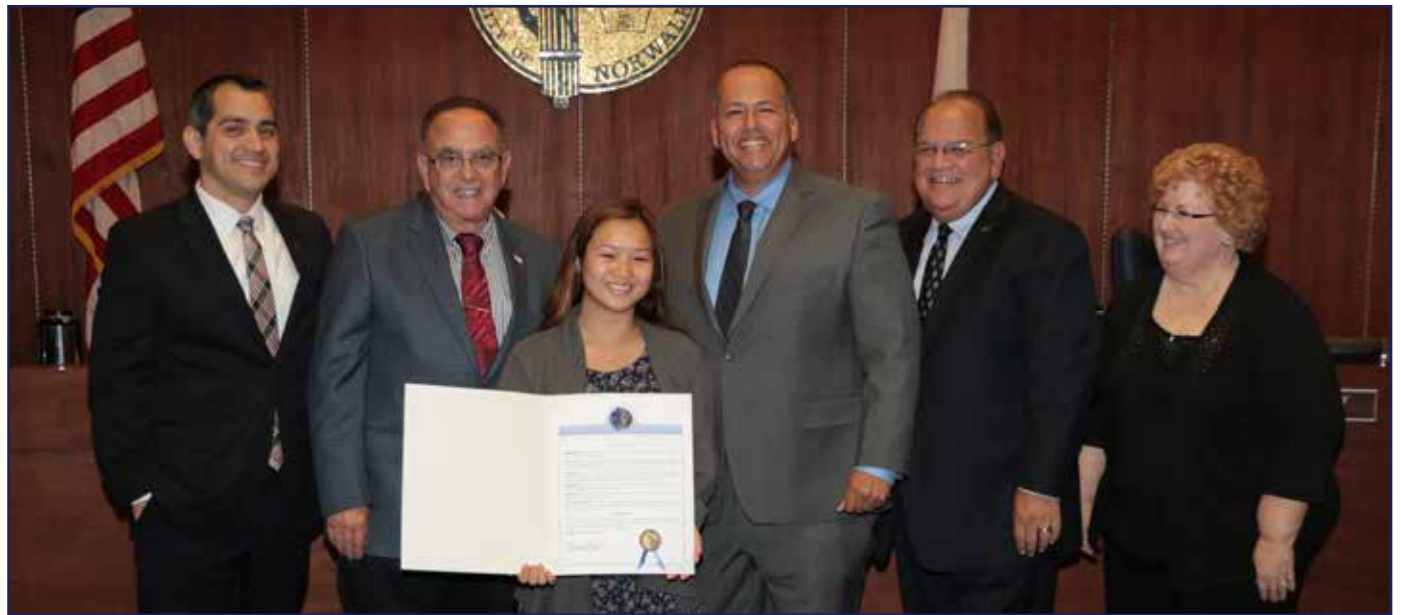
Mayor's Clergy Meeting on July 9