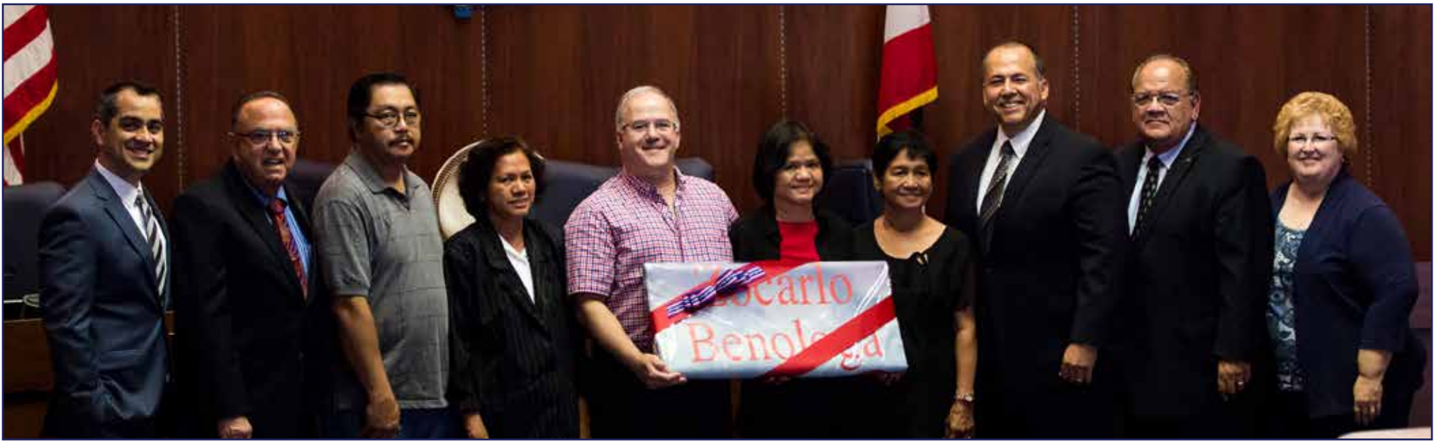
City Council Meeting July 21