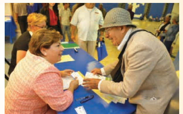
Congresswoman Sánchez talks with a constituent at her 2014 Senior Fair

Congresswoman Sánchez's 13th Annual Senior Fair takes place on Friday, August 14, at Cerritos College. At this free public event, senior citizens will have the opportunity to access helpful services and information from local organizations and agencies, including health screenings, veterans assistance, fraud prevention education, housing and utilities assistance, and elder rights information. The event runs from 9:00 a.m. to 12:00 p.m. in the Student Center. Cerritos College is located at 11110 Alondra Boulevard. No registration is required. For more information, call (562) 860-5050.