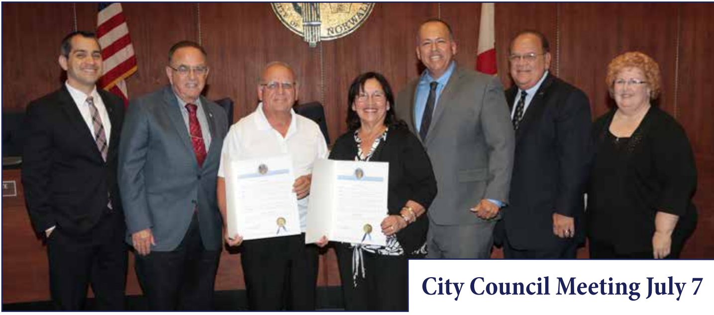
City Council Meeting July 7