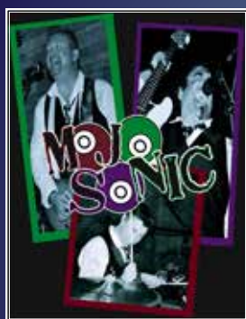
Wednesday, July 8 Mojo Sonic Cover Band

Free entertainment for the entire family! Concerts will be held beginning at 7:00 p.m. Bring your blankets, chairs, picnic baskets, and be serenaded under the stars. Arrive early to guarantee a great view. Refreshments will be available for purchase. For more information, please call (562) 929-5702. Concerts are tentative, based on approval of the FY 15/16 budget.