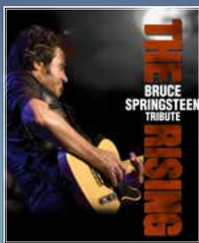
Wednesday, July 15 The Rising Bruce Springsteen Tribute