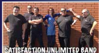
Wednesday, July 29 Satisfaction Unlimite Classic Rock