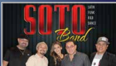
Wednesday, August 12 Soto Latin R & B