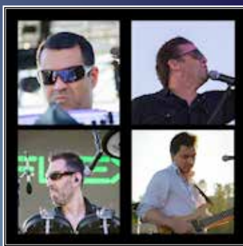
Wednesday, July 22 The Reflexx 80s New Wave