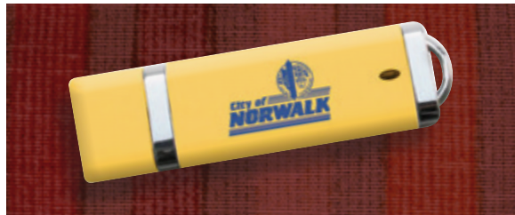
Everyone who attends the State of the City Address will receive a free 64 MB u-drive loaded with the "2020 Vision" Strategic Action Plan. The u-drive, complete with a formatted e-magazine of the plan, cost $3 each, compared to printed copies, which cost more than $10. Plus, with the plan using just 4MB, you'll have 58MB of free space to use.