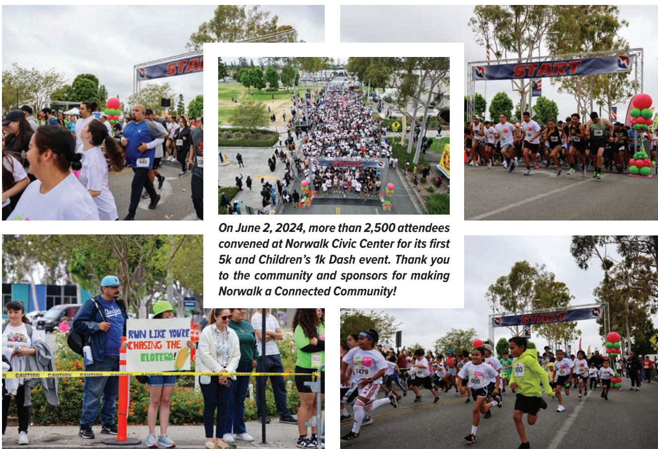
On June 2, 2024, more than 2,500 attendees convened at Norwalk Civic Center for its first 5k and Children's 1k Dash event. Thank you to the community and sponsors for making Norwalk a Connected Community!