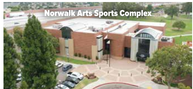
Norwalk Arts Sports Complex