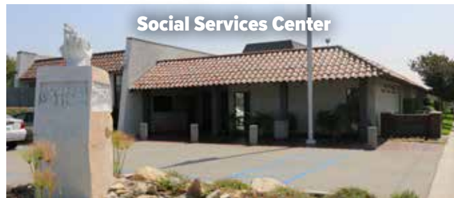
Social Services Center