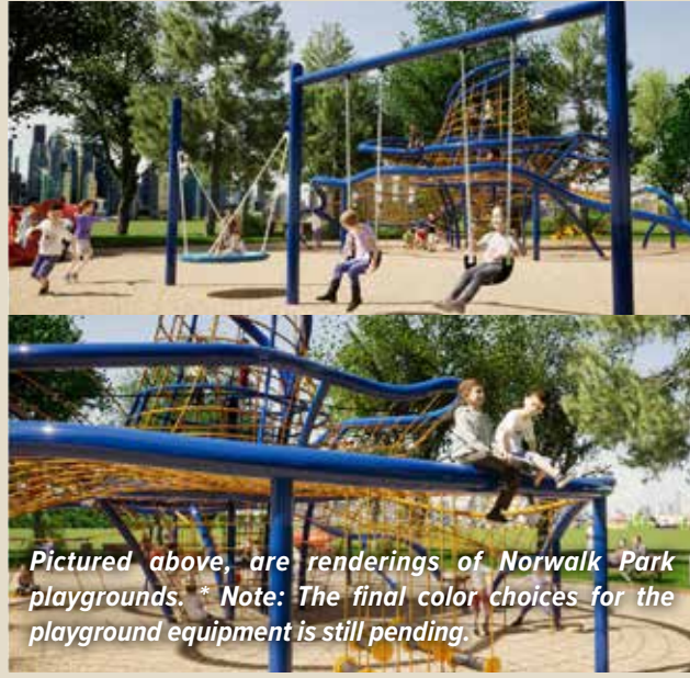
Pictured above, are renderings of Norwalk Park playgrounds. * Note: The final color choices for the playground equipment is still pending.

Each new playground will include climbing equipment, activity areas, and slides for both 2–5-year-olds and 5–12-year-olds. Each of the playgrounds will be installed within the existing playground footprints, except for Norwalk Park, which will have the new playground situated at a new location within the park. Check out the City's social media pages for future updates regarding these projects.