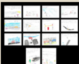
3rd Grade Class (Group Winner) Moffitt Elementary