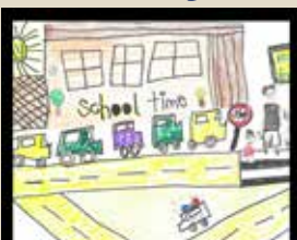
Brielle R. Glazier Elementary