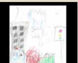
Jazzley V. Nuffer Elementary