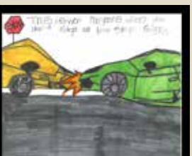
Armando O. Glazier Elementary

In the spirit of Traffic Safety Awareness month, the Department of Public Safety conducted a youth art contest. Norwalk youth were invited to demonstrate their