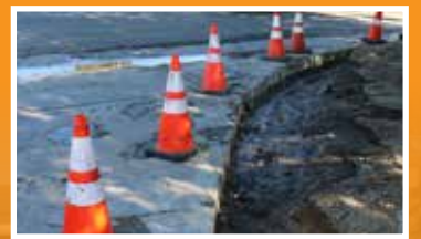
CHESHIRE ST AND NORWALK BLVD