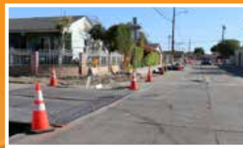
LOWEMONT ST AND CLARKDALE AVE