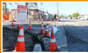
NORWALK BLVD AND LOWEMONT ST