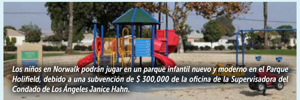
Los niños en Norwalk podrán jugar en un parque infantil nuevo y moderno en el Parque Holifield, debido a una subvención de $ 300,000 de la oficina de la Supervisadora del Condado de Los Ángeles Janice Hahn.

We thank Supervisor Hahn for her partnership in our efforts to ensure that children of all ages and abilities have a safe and accessible playground.