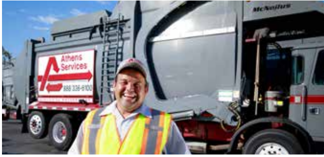
En conmemoración del Día de los Caídos, el barrido de calles y la recolección de basura no se llevarán a cabo el lunes 27 de mayo. La recolección de basura se llevará a cabo el día después de la normal recolección.

For questions about trash collection, contact Athens Services at 888-336-6100. For street sweeping questions, call Public Services at 562-929-5511, with parking enforcement inquiries for Public Safety at 562-929-5732.