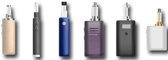
Source: US Surgeon General Report 2016-17; CDC's Office on Smoking and Health; Food and Drug Administration; LA County Sheriff's Department – Norwalk Station “Vape and your Teen”.

Flavorings: Vape flavorings have the potential to be harmful to the lungs when inhaled. There is currently little regulation surrounding these flavors and what chemicals are used to make them.