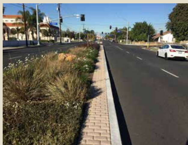
Los mejoramientos en los centros de las pistas, que incluye el reemplazo del césped muerto con un paisaje tolerante a la sequía, fueron completados en noviembre. Aproximadamente 6,000 plantas fueron instaladas ayudando a embellecer a nuestra ciudad.

In July 2015, the City applied for a grant with the California Natural Resources Agency to replace existing turf on City medians with drip irrigation systems and drought tolerant plants. The grant known as the Environmental Enhancement and Mitigation Program (EEMP), was approved in August 2016, in the amount of $416,260. Work consisted of removal of soil and dead turf, installation of drip irrigation systems, construction of six water quality channels on Norwalk Boulevard side panels and installation of more than 6,000 plants within the medians. The work was completed on November 30, 2018 for a total cost of $369,818.95. The City anticipates receiving more than $410,000 in reimbursement for the grant.