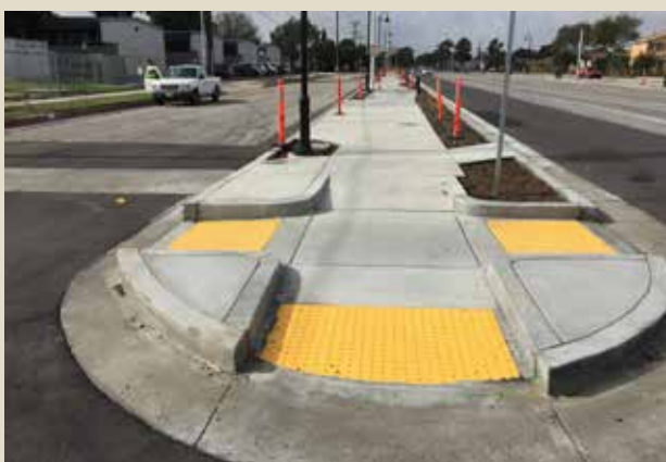
Los pasillos peatonales en los paneles laterales de Foster entre Studebaker y Pioneer se han completado. Próximamente se instalara vegetación, carriles para bicicletas, y señalización de parada con la esperada terminada del proyecto a fin de mes.

The pedestrian walkways on the Foster Road side panels between Studebaker Road and Pioneer Boulevard have been completed including the new pedestrian lighting. Landscaping will soon be installed on the panels. To complete the project the lane striping on Foster will be redone to add bicycle lanes the full length of the street and the vehicle lanes will be reduced from two lanes to one lane in each direction. New enhanced stop signage will be installed. The new traffic signal at Jersey and Foster will be activated after the lane striping is redone. The project is expected to be completed by the end of this month.