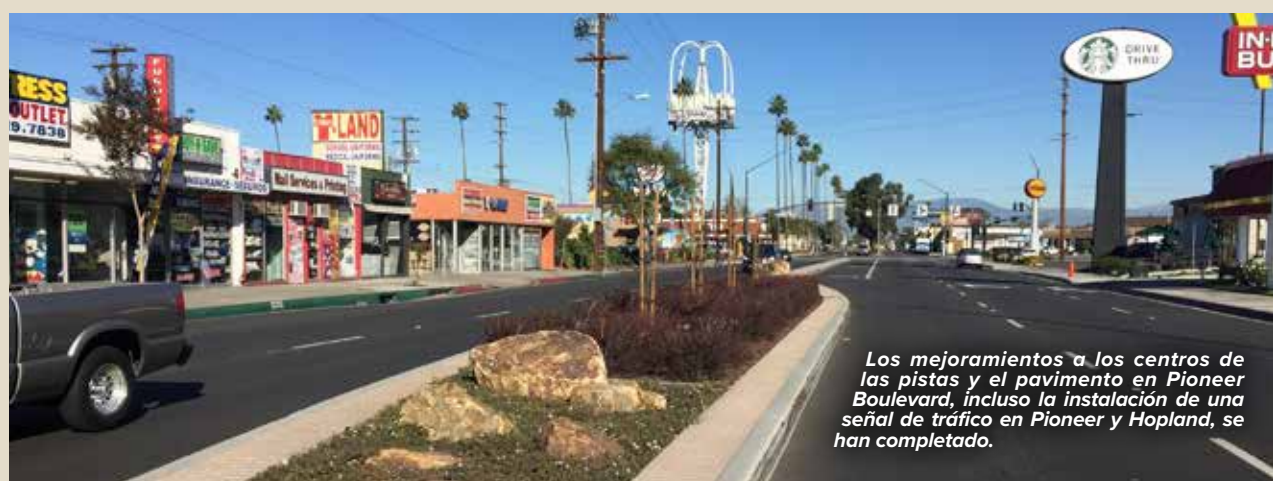
Los mejoramientos a los centros de las pistas y el pavimento en Pioneer Boulevard, incluso la instalación de una señal de tráfico en Pioneer y Hopland, se han completado.

The construction of landscaped median islands and the repaving of Pioneer Boulevard between Rosecrans Avenue and Alondra Boulevard was completed in December. The $2.5 million project included a new traffic signal at Pioneer and Hopland and was completed within budget.