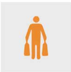
Occasional Rider I ride a bus at least once per month