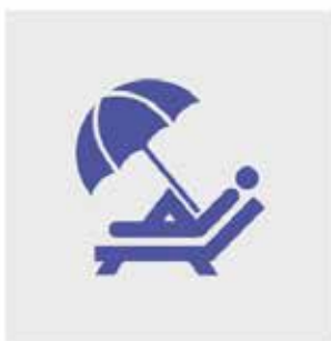
Infrequent Rider I have ridden a bus in the past year