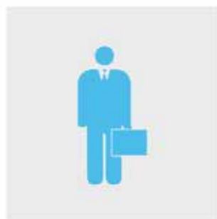
Frequent Rider I ride buses 3+ times per week

Metro is reimagining its bus system for the next generation. Tell us a little about yourself, give us your input, and help us plan better bus service.