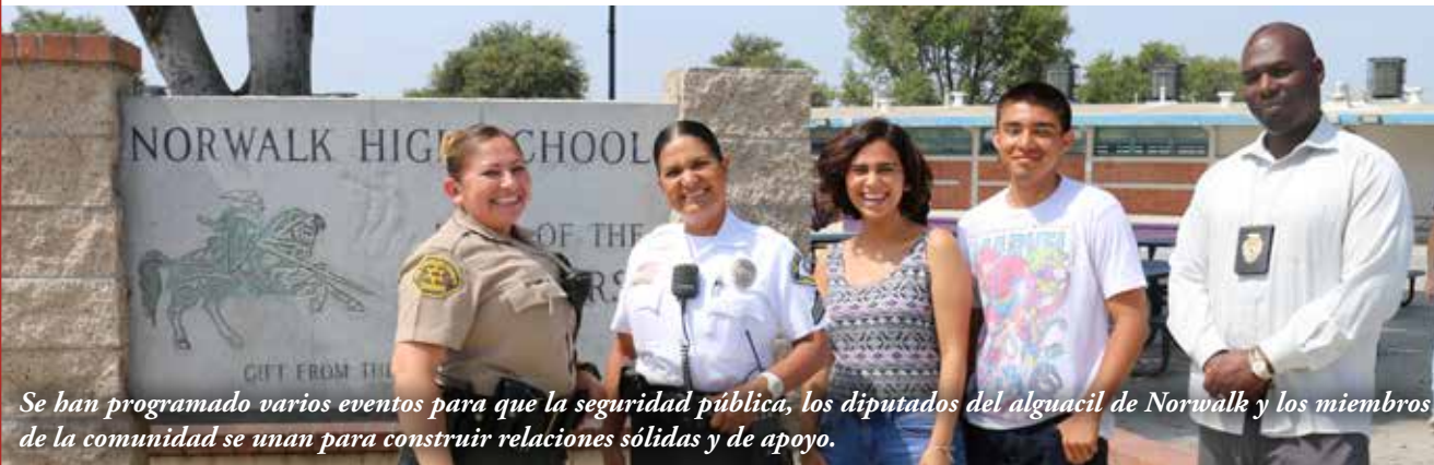
Se han programado varios eventos para que la seguridad pública, los diputados del alguacil de Norwalk y los miembros de la comunidad se unan para construir relaciones sólidas y de apoyo.

Our residents are one of the most important members of our safety teams. Your involvement and continued active support are critical to achieving our common goal of safe, secure neighborhoods, and we have established a number of events to enhance our networking and build strong relationships. We encourage you to watch for and participate in your Neighborhood Watch Meetings, Community Forums, Neighborhood Block Parties, "Coffee with a Cop" events and other city-sponsored activities. Contact your Department of Public Safety to learn how you can get involved in helping to keep your neighborhood and community safe.