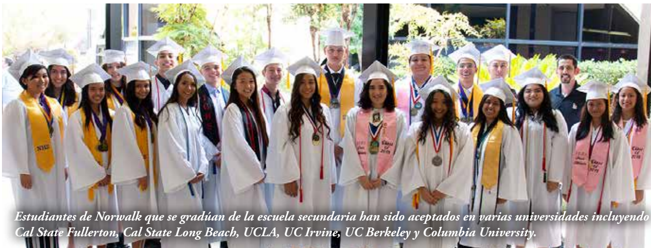
Estudiantes de Norwalk que se gradúan de la escuela secundaria han sido aceptados en varias universidades incluyendo Cal State Fullerton, Cal State Long Beach, UCLA, UC Irvine, UC Berkeley y Columbia University.

to name just a few of the campuses where you'll find last year's Eagles, Lancers, Chiefs and Bulldogs. Look for banners bearing the images of participating students and their college destinations on display throughout the city, courtesy of a new program created by the Norwalk Education Alliance. We wish all of them success!