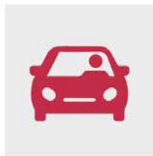
Non-Rider I have not ridden a bus in the past y...