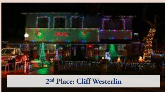
2 nd Place: Cliff Westerlin