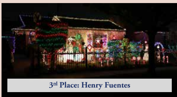
3 rd Place: Henry Fuentes