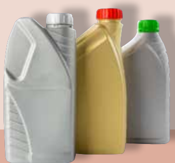
*Event is brought to you by a CalRecycle grant.

Saturday, November 11 • 9 a.m. to 1 p.m. O'Reilly Auto Parts, 12233 Norwalk Blvd.