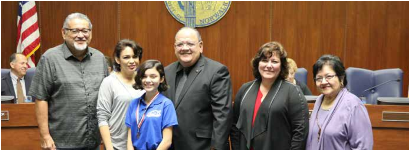
Photo Highlights: February City Council Meetings