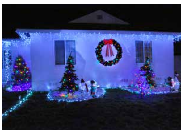
3 rd Place: Thomas Preciado