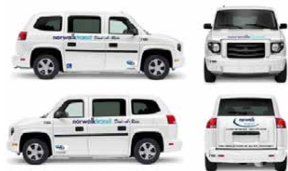
Design Concept for one of NTS's new vans, the MV-1

The NTS Dial-A-Ride program is offered to Norwalk residents age 60 and older and residents with a disability. For more information on Dial-A-Ride, call NTS Customer Service at (562) 929-5550 or e-mail: transportation@norwalkca.gov