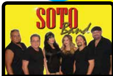
Wednesday, August 3 Soto "National Night Out" Latin R & B