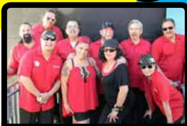
Wednesday, August 10 Sangria Old School Latin & Oldies

Spend your summer evenings with us on the City Hall Lawn for our Summer Concert Series running every Wednesday from July 6 to August 10. Bring your blankets, chairs, and pack a picnic to enjoy live outdoor music with family and friends. Refreshments will be available for purchase. For more information, please call 929-5702.