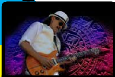
Wednesday, July 27 Smooth Sounds of Santana Santana Tribute

FREE CONCERTS ON CITY HALL LAWN • WEDNESDAYS 7 PM 12700 NORWALK BOULEVARD