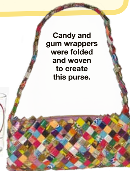
Candy and gum wrappers were folded and woven to create this purse.