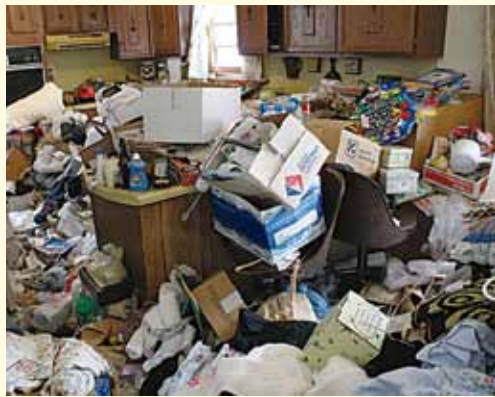
"Hoarding: Buried Alive" is one of the shows that focuses on waste.

Rather than watching re-runs this summer, check out some of the trashy shows on TV. You'll be surprised and probably a little grossed-out, but you won't look at waste the same way again!