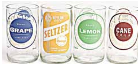
Green Glass makes these tumblers from Boylan soda bottles.

a new line of tumblers made from soft drink and beer bottles. The company's designs take ordinary bottles and turn them into extraordinary glasses, pitchers, and vases. To see Green Glass products, which are sold in gift shops as well as online, visit www.greenglass.com .