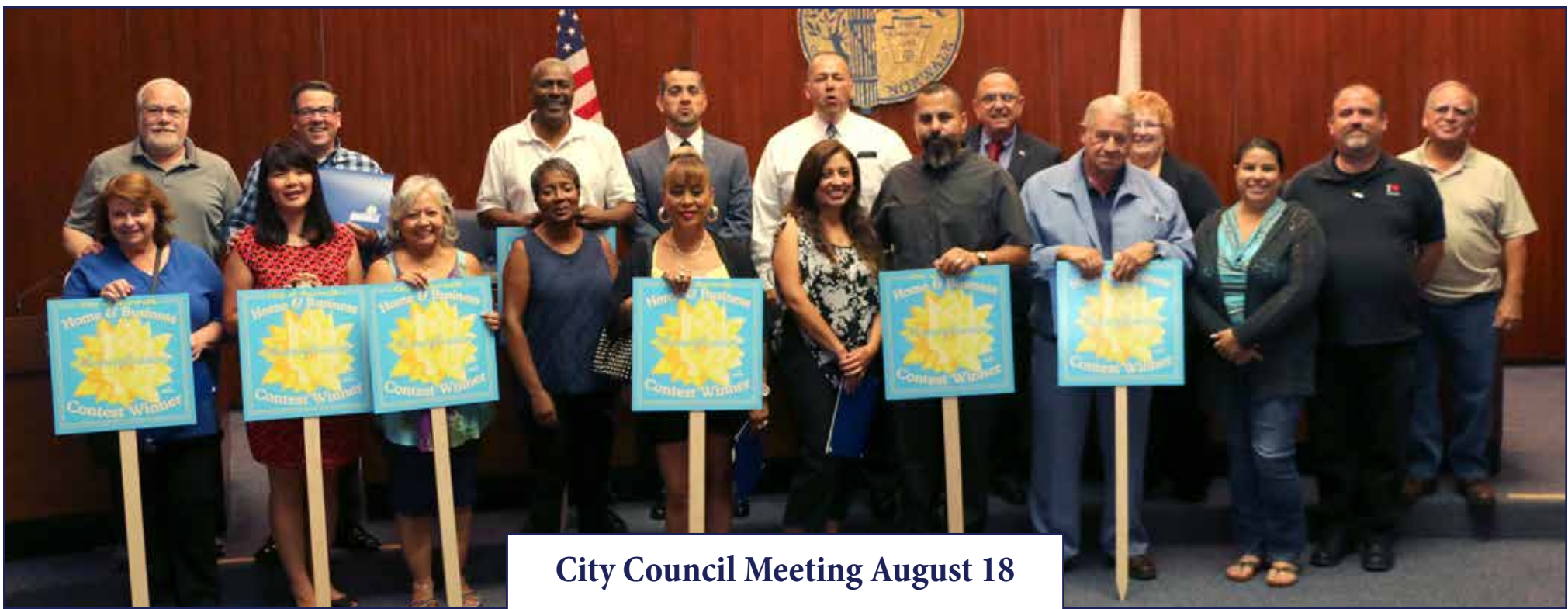
City Council Meeting August 18