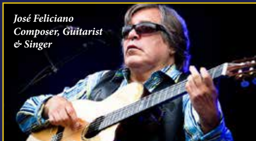
José Feliciano Composer, Guitarist & Singer

Hispanic Heritage Month September 15-October 15