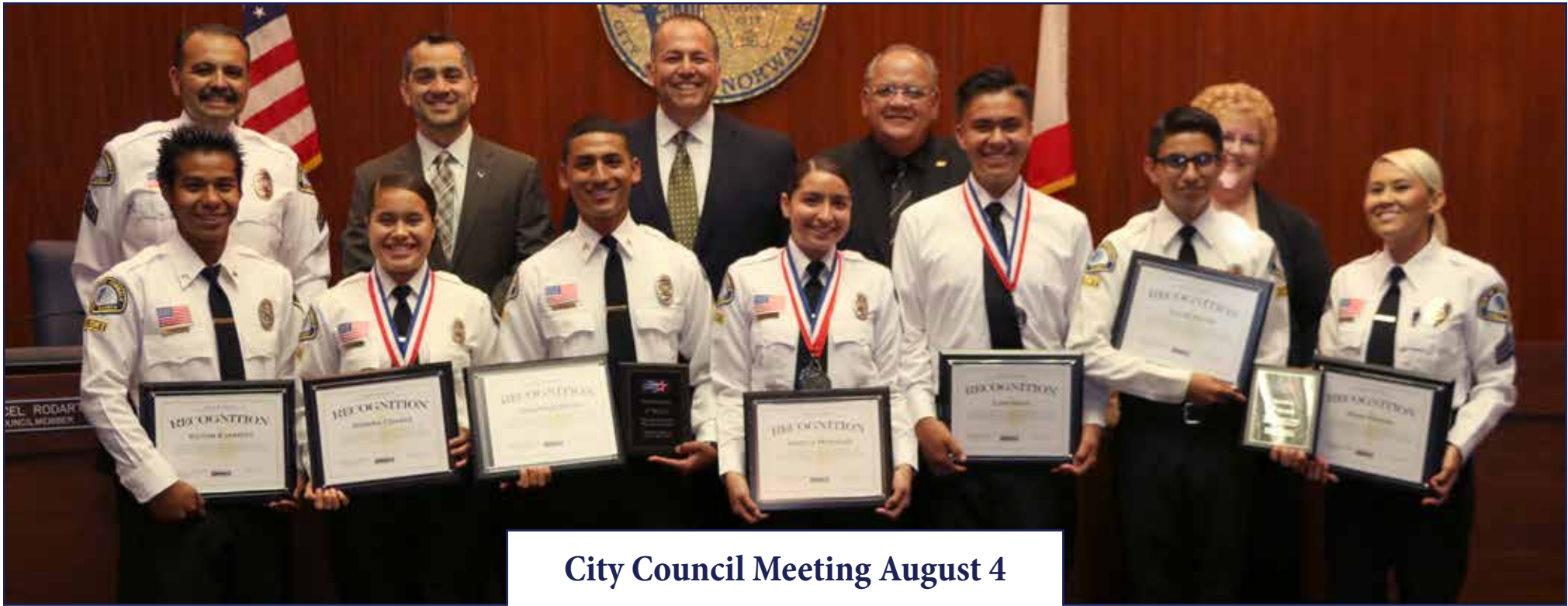
City Council Meeting August 4